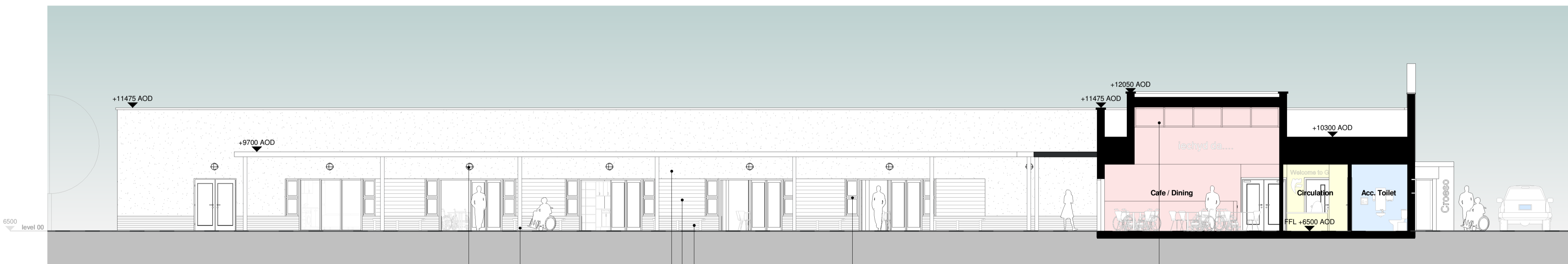
3 GA Section 3 - Proposed Scale: 1 : 100