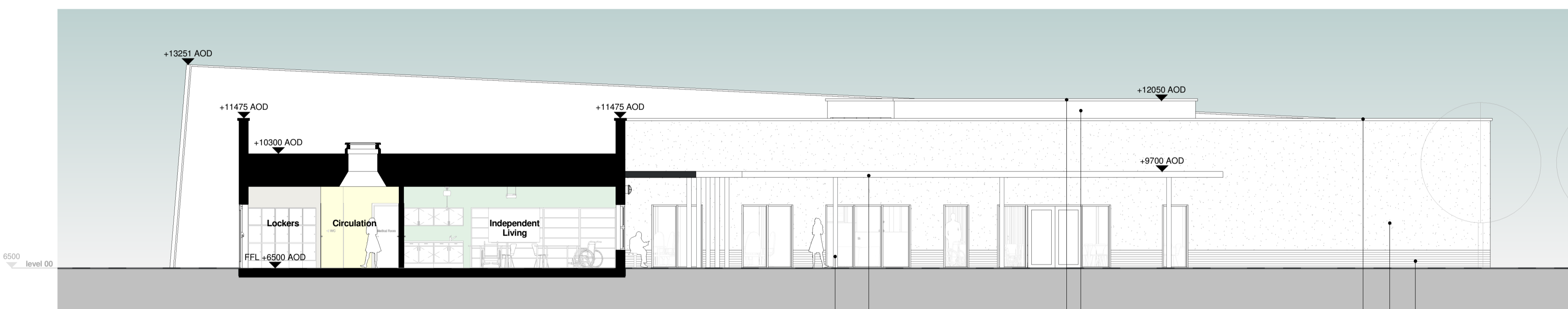
2 GA Section 2 - Proposed Scale: 1 : 100